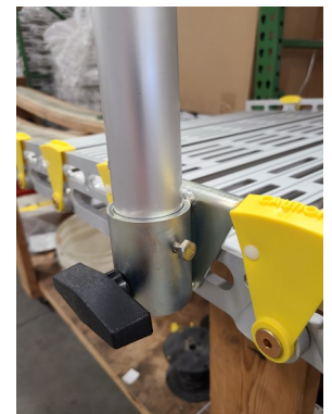
Handrail Inserted into Bracket