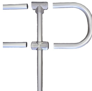
Loop End Assembly