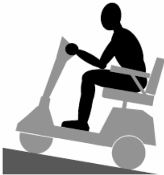
GOING UP AN INCLINE