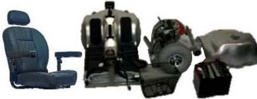
Avenger Components (Model GA541)

Now you are ready to load the scooter into your vehicle. Please note the Avenger will not fit into the trunk of a compact car.