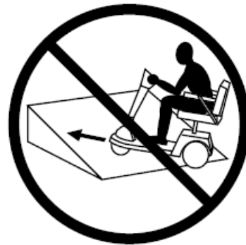
TRAVERSING AN INCLINE